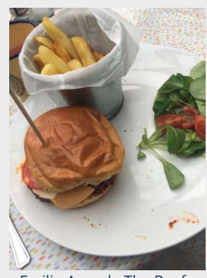
Emilio A made The Beefy Boys' 'pizza boy'...

and all they are doing to support the community at this difficult time. Well done to all of you who have risen to Mr Wright's challenge to cook meals from your favourite restaurants!